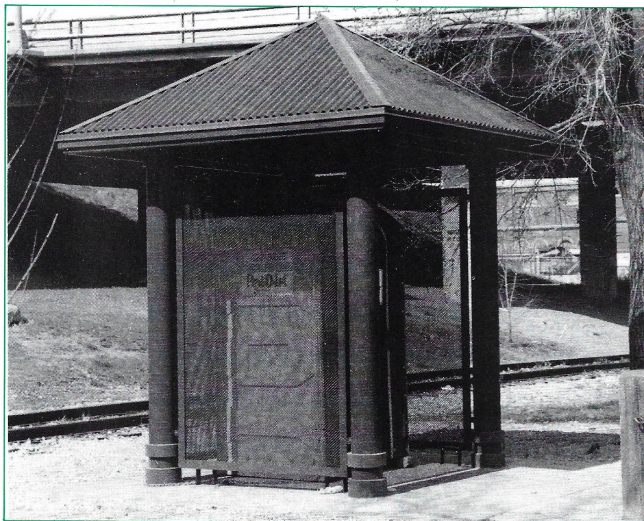
This new restroom facility is a welcome addition to Fishback Landing.

The Greenway Foundation looks forward to a continued cooperative and productive relationship with Denver Parks and Recreation as we pursue our shared goal of adding further improvements to Denver's Platte River Greenway.