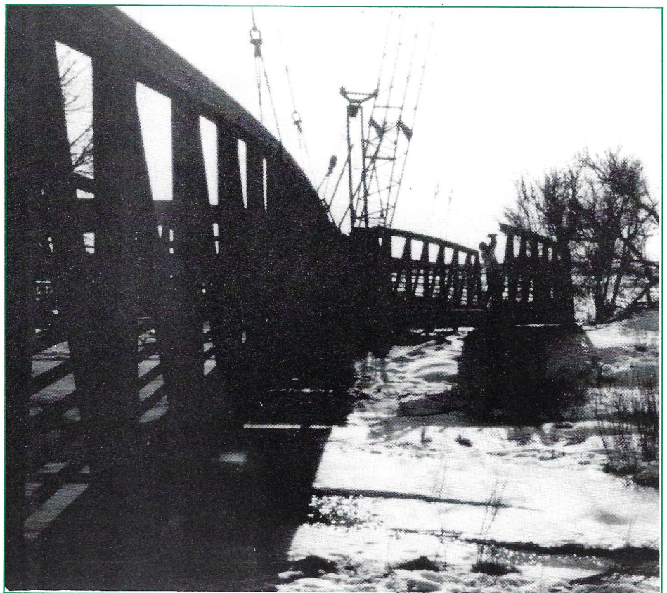
Workers install the 150 foot pedestrian bridge across Cherry Creek in Douglas County, one of three such bridges included in the newest addition to the Cherry Creek South Greenway.

As always, feel free to contact the Greenway Foundation (698-1322) with any questions pertaining to this extensive and on going project.